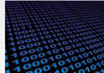
One Code Base